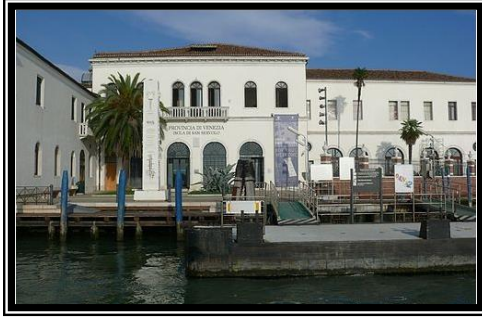
Venice International University

We invite you to consider spending part of your summer participating in Widener's Summer Abroad program in beautiful Venice, Italy. Widener's Venice program offers the opportunity to study law and to absorb the local culture in one of the most beautiful and unusual